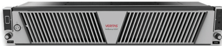
Figure 2. Veritas NetBackup 5250 is an integrated enterprise backup appliance with expandable storage and intelligent deduplication for physical, virtual and cloud environments.

Purpose-built backup appliances (PBBAs) —NetBackup uses its OpenStorage Technology (OST) interface to integrate with a wide range of PBBAs and storage appliances. Veritas offers a full line of Integrated PBBAs that are optimized integrations of NetBackup in a hardware appliance. Designed for enterprise use cases from the edge to the core to the cloud, NetBackup Appliances speed the deployment of NetBackup and provide hardened security, simplified management and proactive support for enterprise-wide data protection. Veritas Appliances ensure end-to-end support of the complete data protection solution. Incorporate the Veritas Appliance Family in your data infrastructure to expand your data protection capabilities (see Figure 2.)