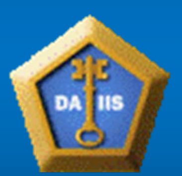
DA Intelligence Information Services