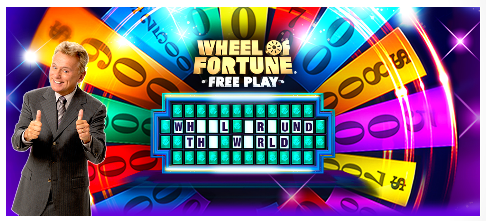
mage: https://13u4696j380164xc32e5s lva-wpengine.netdna-ssl.com/wp-content/uploads/2016/09/WOF\_Apple\_promo\_art\_Aug16\_1200x530\_v2.jpg